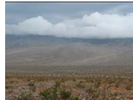
Large outwash fan from the Cottonwood Mountains along the eastern flank of the valley