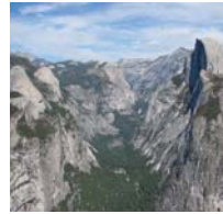
Half Dome looking north up Yosemite Creek hanging