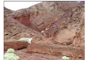
Recent offset marked by a step off in recent alluvial deposits along the Black Mountain fault Zone