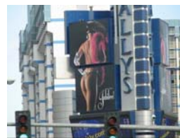
It's the size that counts in Las Vegas. Everything is big!!

As we left the Valley we looked through the rising cloud which had veiled the mountains and kept us wet and cool all day to see Las Vegas almost in an ethereal light!