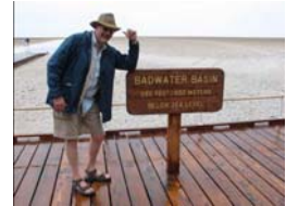
OB at 282ft below sea level! Badwater Spring