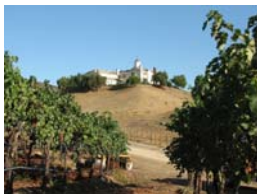
A Temecula Wine Farm in Southern California!